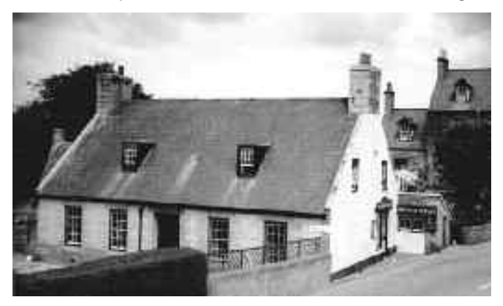
Sunny Corner; '60s shoe shop

In the past 50 years, the motor trade has changed considerably. Motor mechanics were, in fact, engin-