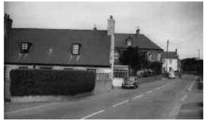
Sion looking north in the '60s

During my 50 years at Sion, I have seen many changes in the village, from the transition of Sion House from a family residence to flats; Le Vesconte & Coutanche's carpentry and painting business changing to an office for Windowcare, a golf shop, and now a tile shop; a small village development at La Chaumière, and the closure of Sion Methodist Church. We also had Mr