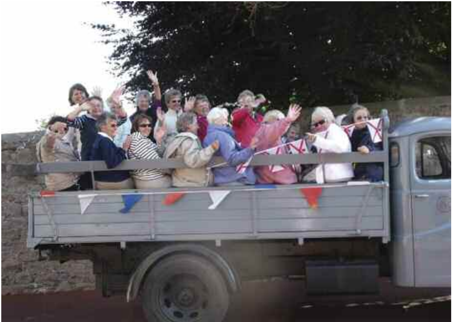
A lorry-load of fun for St John's WI