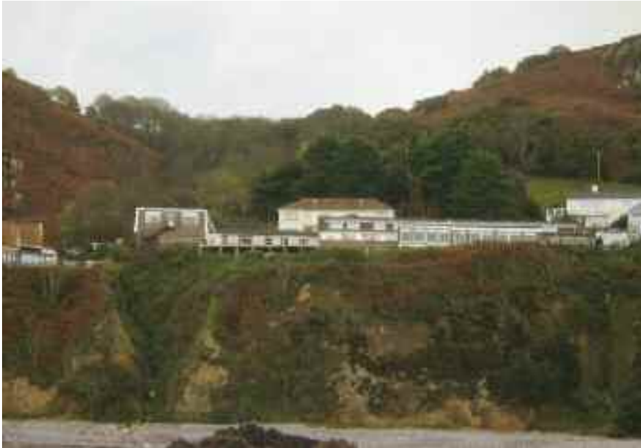
Cheval Roc Hotel site from the sea

In 2001 the Planning and Environment Committee refused an application to convert the Cheval Roc Hotel into 20 flats. They stated: 'due to the scale and intensification of use, the proposals would be harmful to the character and appearance of this sensitive part of the green zone'.