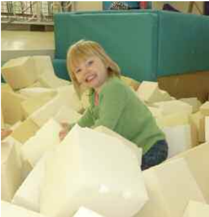
A sponge-cube scrambler

The toddlers' faces absolutely lit up as they bounced into the gym! Les Frères Toddler Group had been invited to De Mond Gymnastics Academy just next door in the sports hall. Every surface is soft and cushioned and the children confidently took full advantage. They ran and bounced on the huge trampoline, scrambled through the sponge cubes and altogether had a wonderful time. The only tricky part was encouraging the toddlers to leave. Even the grown ups seemed reluctant!