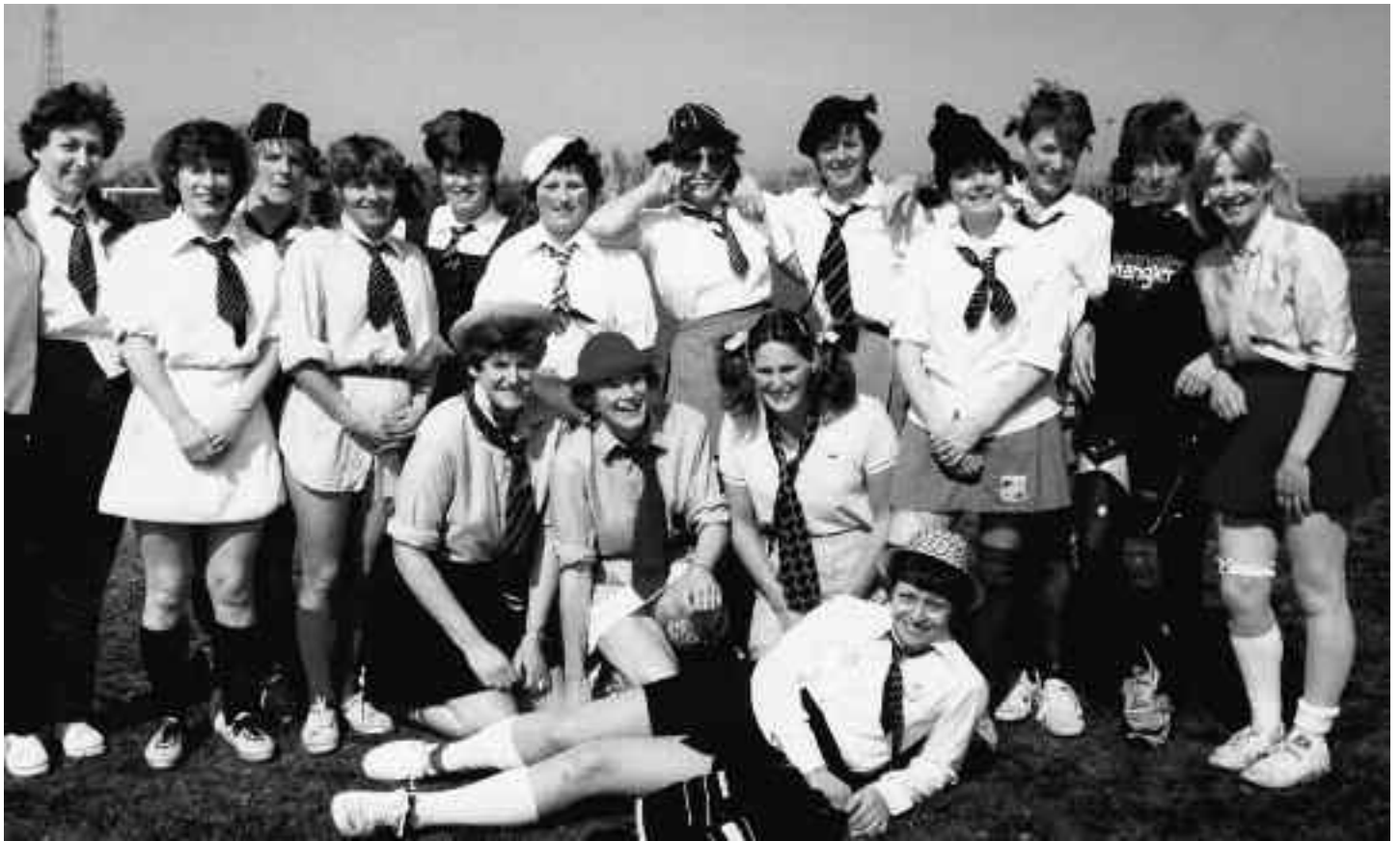
St John's School PTA mums prior to a football match against the children in the early 80s. A few grandparents may recognise themselves