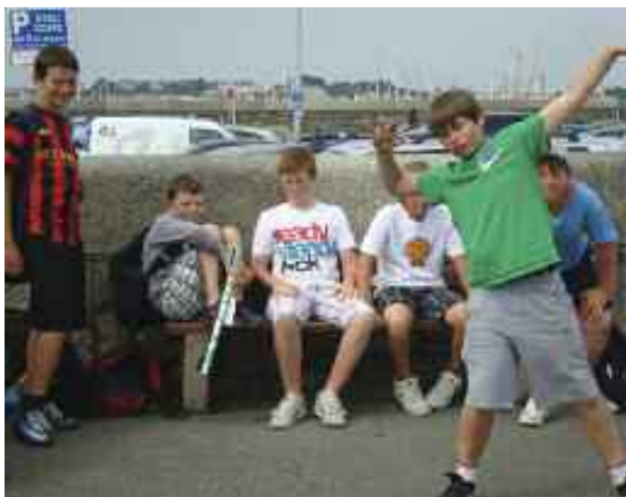
Youth in Guernsey

In September the Parish agreed a new four-year partnership with the Youth Service and the Youth Project committee, a sign of their continued commit-