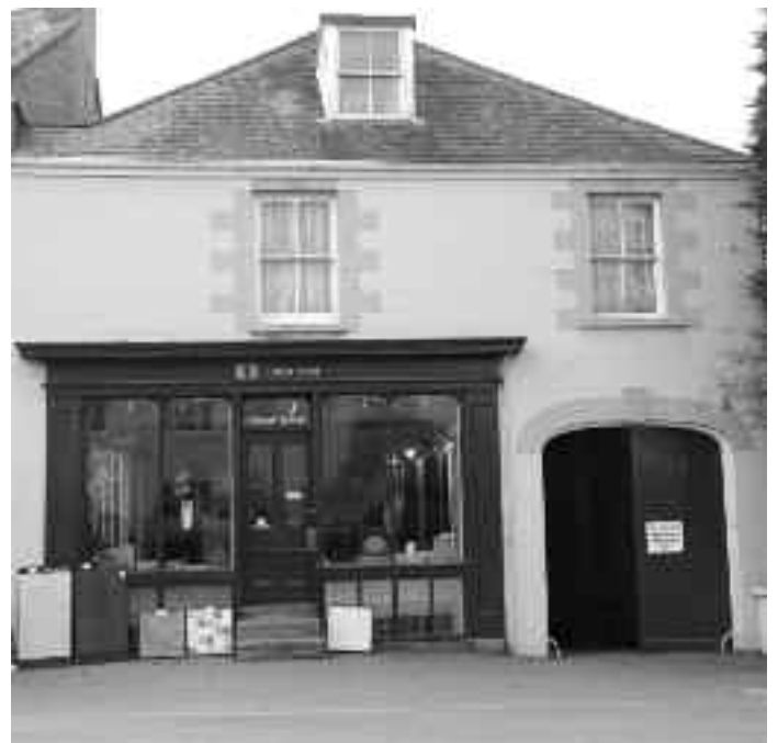
The shop was the original Methodist Chapel in Sion. The Foundation stone was laid in 1826

Clients who come to the shop can simply buy