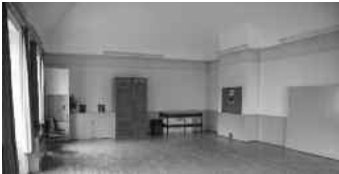
Hall on first floor

You will, I trust, already be familiar with The United Reformed Church – the terracotta painted building on your left as you go down La Grande Route de St Jean on your way to St Helier or on your right as you head north. We have been here a long time, over 200 years in fact, although like many of you we have changed our name on the way. Some of