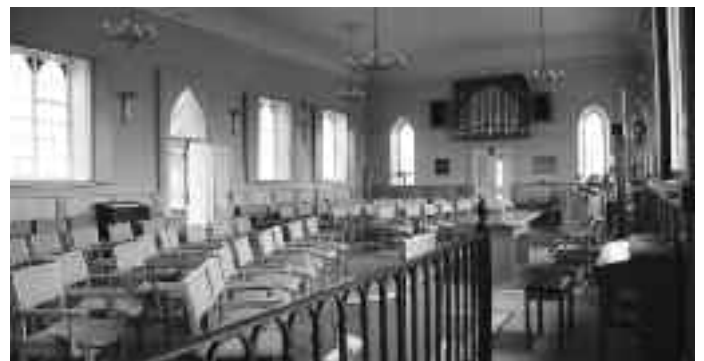
Light and welcoming Church

Or why not just come along to see us? We meet every Sunday morning at 10.30 for an hour and then spend a short social time together over a cup of tea or coffee and you would be made most welcome. We also have a limited number of mid-week activities, e.g. the Monthly Monday Meeting on the