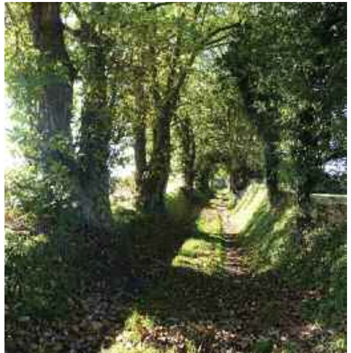
An eastern section of the path; a leafy lane in Trinity