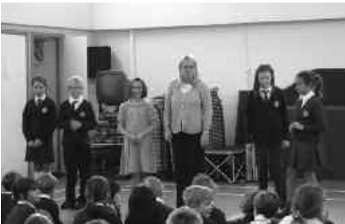
School Council Hustings

Our first meeting was a success. The new representatives were welcomed into the School Council and we discussed the importance of their roles and some of the things that they will be involved in this year. We spent this time discussing the roles of the executive committee and we voted for nominated roles. This term, the nominated chairperson has been chosen from Year 6. She was the only representative nominated and was therefore voted in by