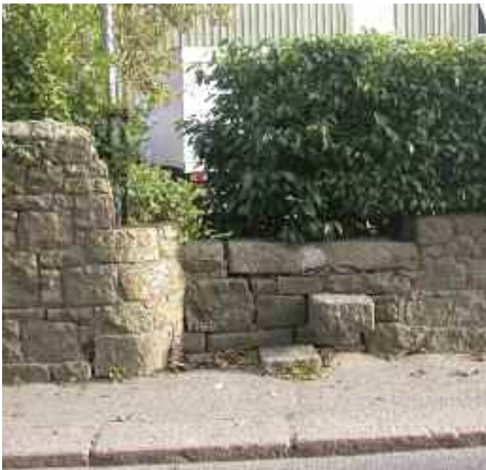
Steps mark the west end of the footpath on La Grande Route de St Jean

On the 17th August 1997 the 'voyeurs' (sworn representatives of the parishioners) requested the Royal Court upon its Visite Royale to the Parish to view the footpath as it had been obstructed in recent