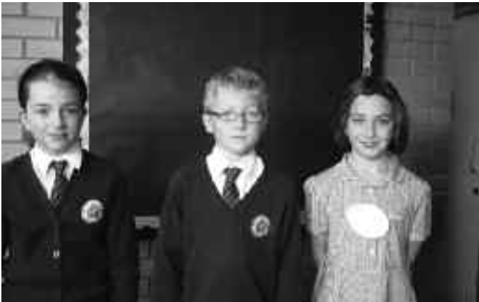
Candidates for the Council

All class representatives are allowed their time to speak and to be listened to. We value all comments and think about how we can make improvements in and around our school and community.