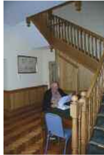
New oak staircase to Committee Room

The Connétable has taken the opportunity to re-vamp the ground-works around the Parish Hall,