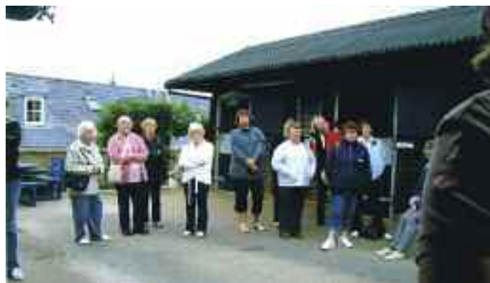
WI members at the Malzard racing yard.

Our Christmas Party takes place on Monday December 6th at 7.30 at Ebenezer. The Harmony Men will be entertaining us in the Church, and then