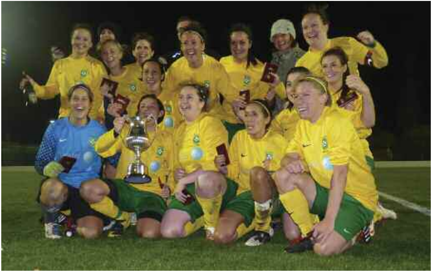
Proudly holding the Zenith Cup in their Newtel Solutions kit.