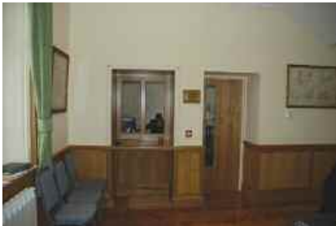
Counter in the lobby

although there is yet some hedging to be planted.