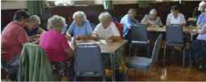
Eyes down in the Parish Hall

The aim of St John's Golden Age Club is to provide an opportunity for our members to meet on the last Wednesday of the month and enjoy each other's