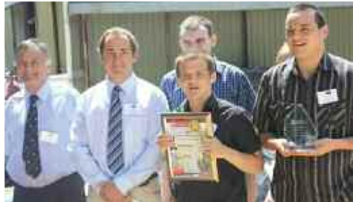
Proud pond project workers with their Insurance Corporation of the Channel Islands 2010 Award, awaiting the arrival of the Earl and Countess of Wessex.

won this year's Insurance Corporation of the Channel Islands Conservation Project of the Year Award. We also run our very successful Taking Part Making Art Project. This is just a flavour of the many things Jersey Mencap does, funds and gets involved with, as well as trying to meet the many financial demands made upon us. This is why fund raising and raising our charity profile is so essential.