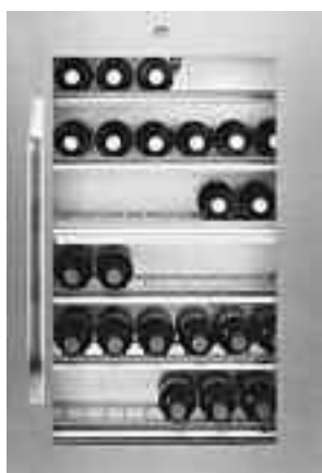
Wine coolers are available from Liebherr, Whirlpool, Hotpoint and Neff in single and dual temperature zones. Either free standing or built in, from £300