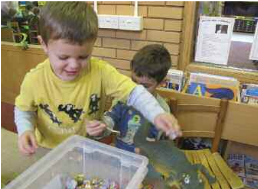
Hard at play in Nursery

Let's go into the Reception class now. Half of the children went to our Nursery and so know the school well but they are doing a great job at welcoming the other half of the class from other settings. You'd never know the difference though because the