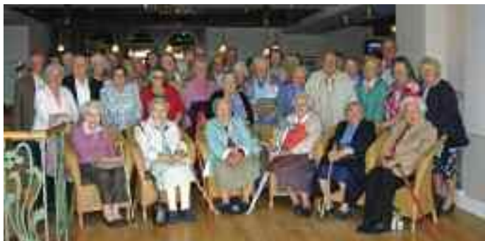
At St Brelade's Bay Hotel

We have at least three outings a year – an Easter and autumn Lunch and afternoon tea in the summer. The St Brelade's Bay Hotel and the Potteries were very popular venues. We travel in a coach provided by the parish and the cost of the outings is subsidised, with our monthly raffle helping to boost funds. At