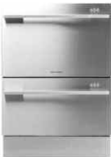
FISHER & PAYKEL three door refrigerator and two drawer dishwasher. Part of a huge range of top quality appliances

Innovative appliances from Neff, such as the slide away door ovens, steamers and flush mounted hobs.