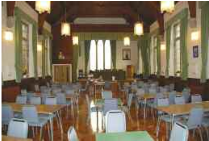
Shiny floor in the main hall