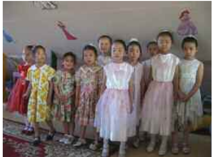
Children of the orphanage.

At weekends we were able to see quite a bit of the countryside, including spending a day with a herder family and experiencing a little of their way of life: idyllic on a warm summer's day to be living in a