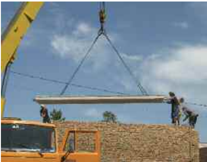
The Jersey Wall

In early June a team of ten volunteers from