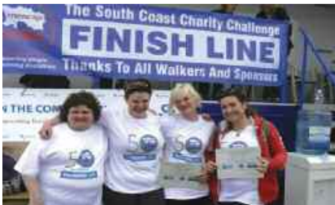
Happy and relieved walkers at the end of our South Coast Charity Challenge which raised over £20,000 for our Adult respite appeal