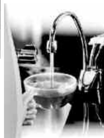
ISE, Quooker and Franke hot taps. Boiling water instantly available with cold filtered water.