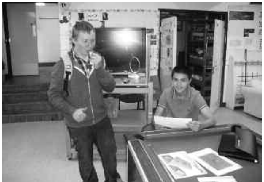
Plans for the stakeboard park.